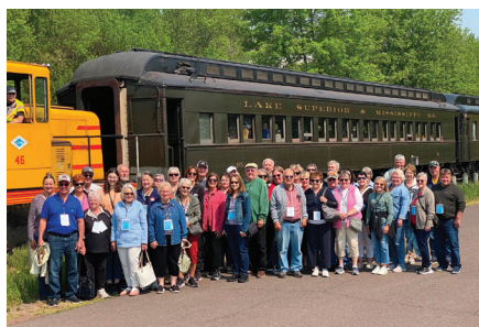
We had a wonderful time on our recent Duluth-Superior trip!

Do you enjoy traveling to interesting destinations and seeing entertaining shows? F&M Getaways is for you! We planned a great line-up of day trips for 2025 and many have already sold out! If you enjoy going to the State Theater, Chanhassen Dinner Theater, Orpheum Theater, Plymouth Playhouse and many other fun destinations, sign up for emails to be first-to-know about upcoming trips.